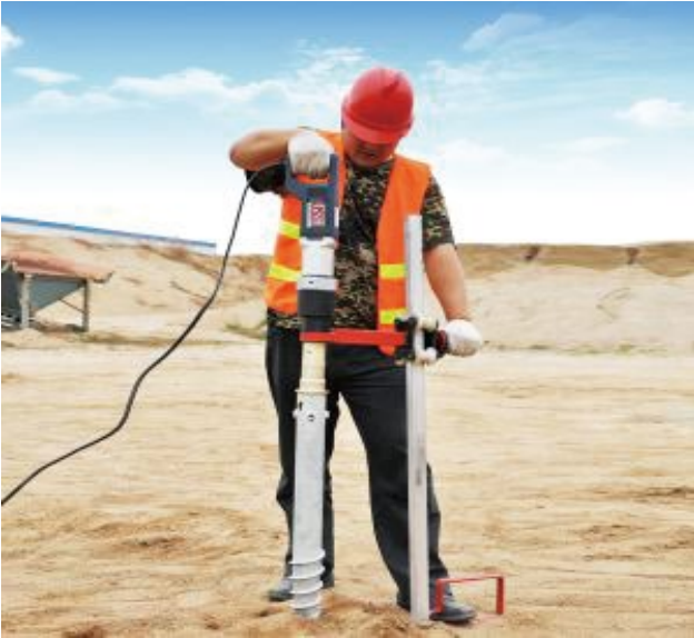
Manual piling machine Easy operation, cost effective for small size ground mount project