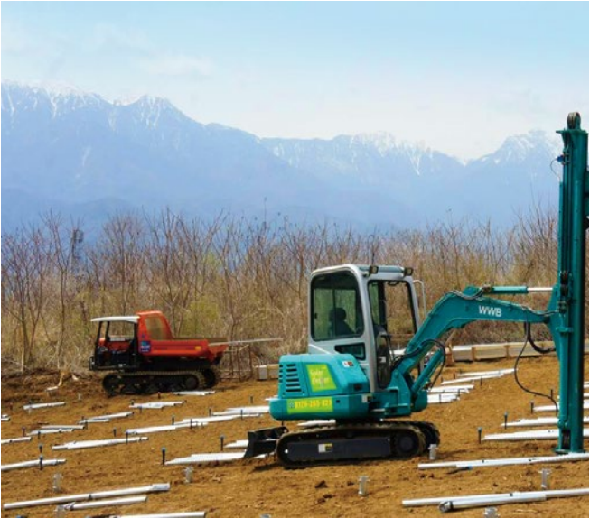
Pile driven machine High installation efficiency, 30-75s for one screw in , ideal for large scale project.